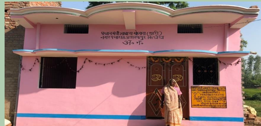
KISMATI DEVI, Ashrafpur