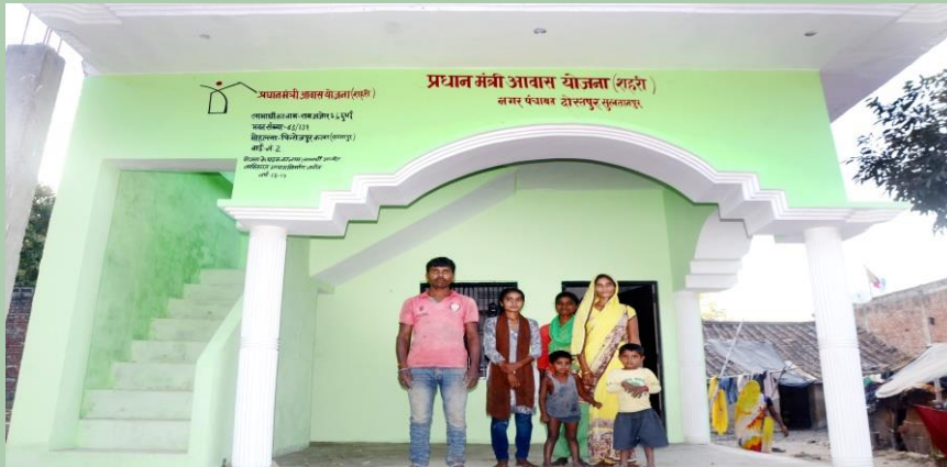
RAM AJOR, Dostpur