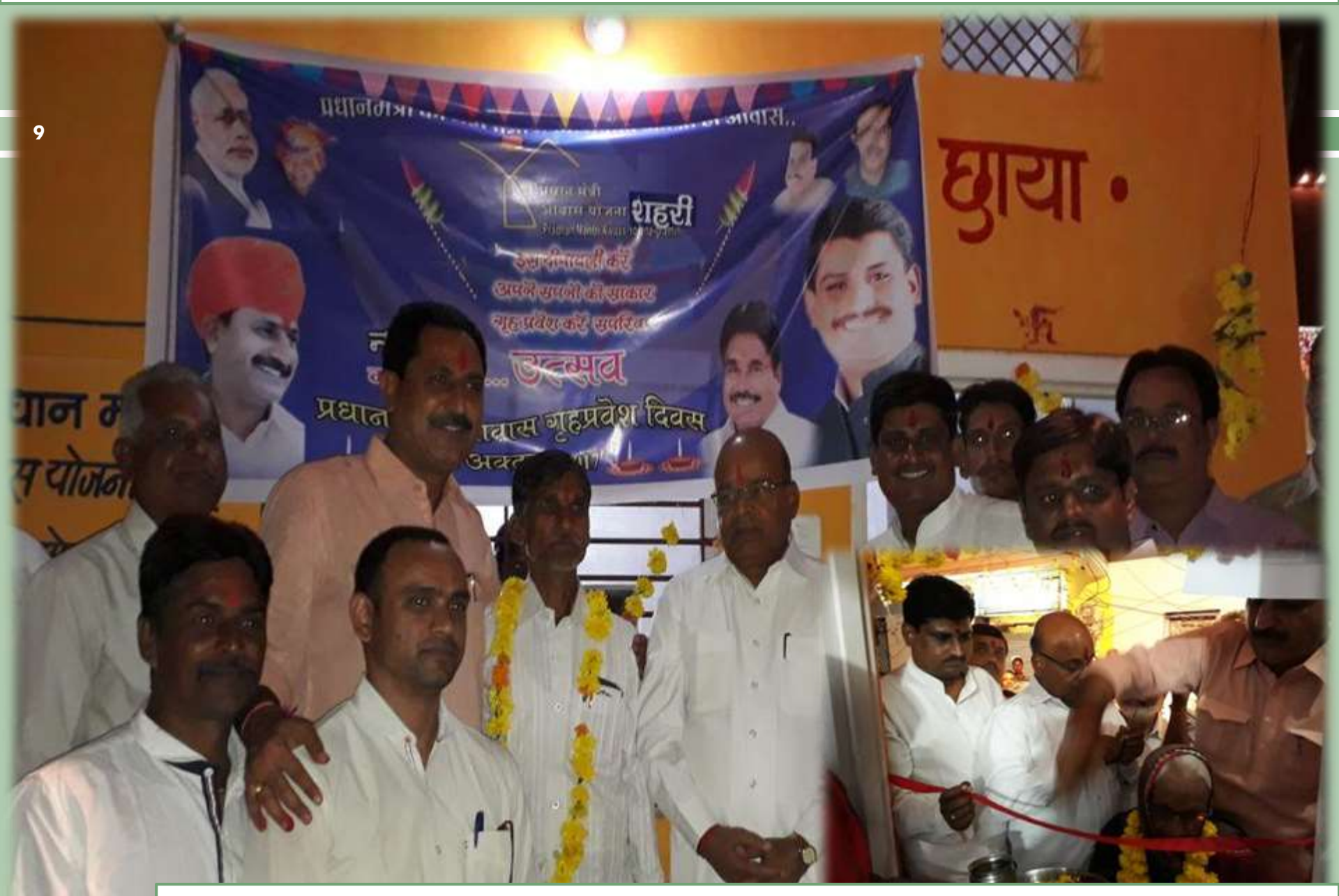
BLC DU Inaugurated by Hon'ble Union Minister for Social Justice & Empowerment in Nagda