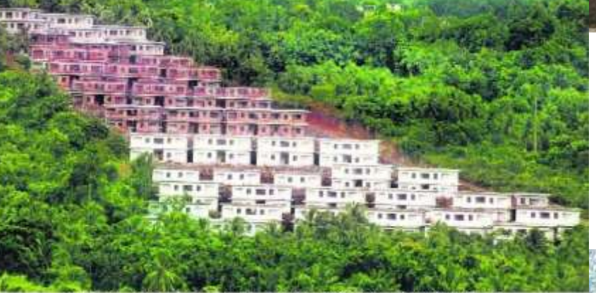
മലപ്പാം കൈനോട് ഐ എപ് എസ്.ഡി.പി പദ്ധതിയിൽ നിർമാണം പൂർത്തിയാകാന്ന വീട്രകാ