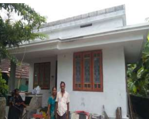
Kudumbashree, Local self Govt Dept., Govt of Kerala