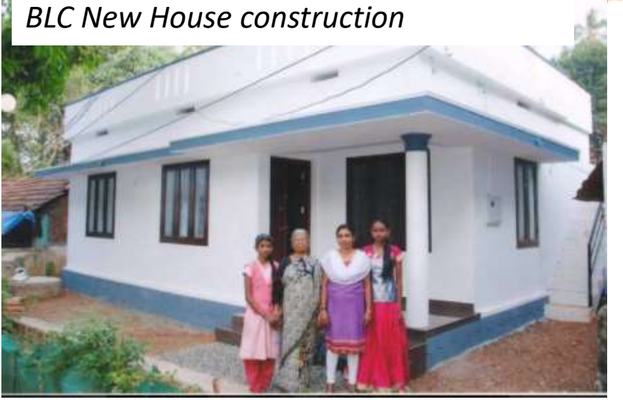
CLSS House purchased