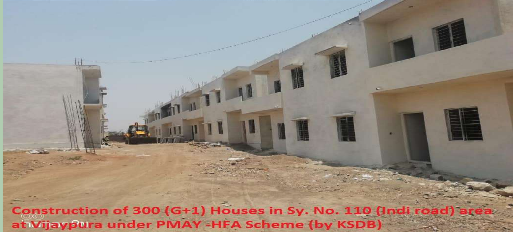
Construction of 300 (G+1) Houses in Sy. No. 110 (Indi road) area at Vijayapura under PMAY -HFA Scheme (by KSDB)