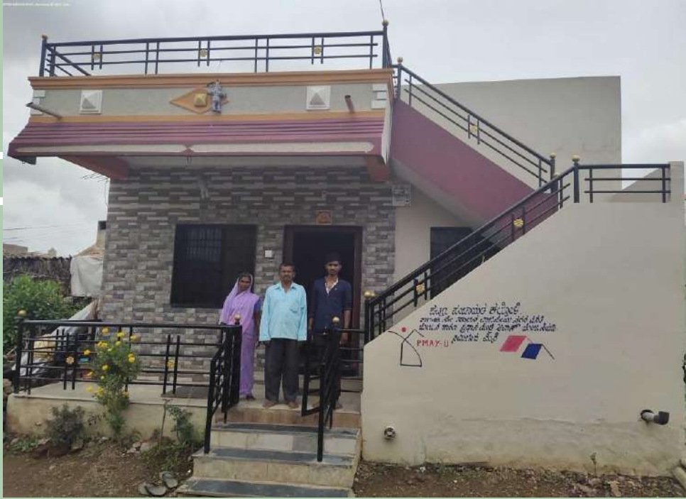
Belgaum dist Kallolli ULB