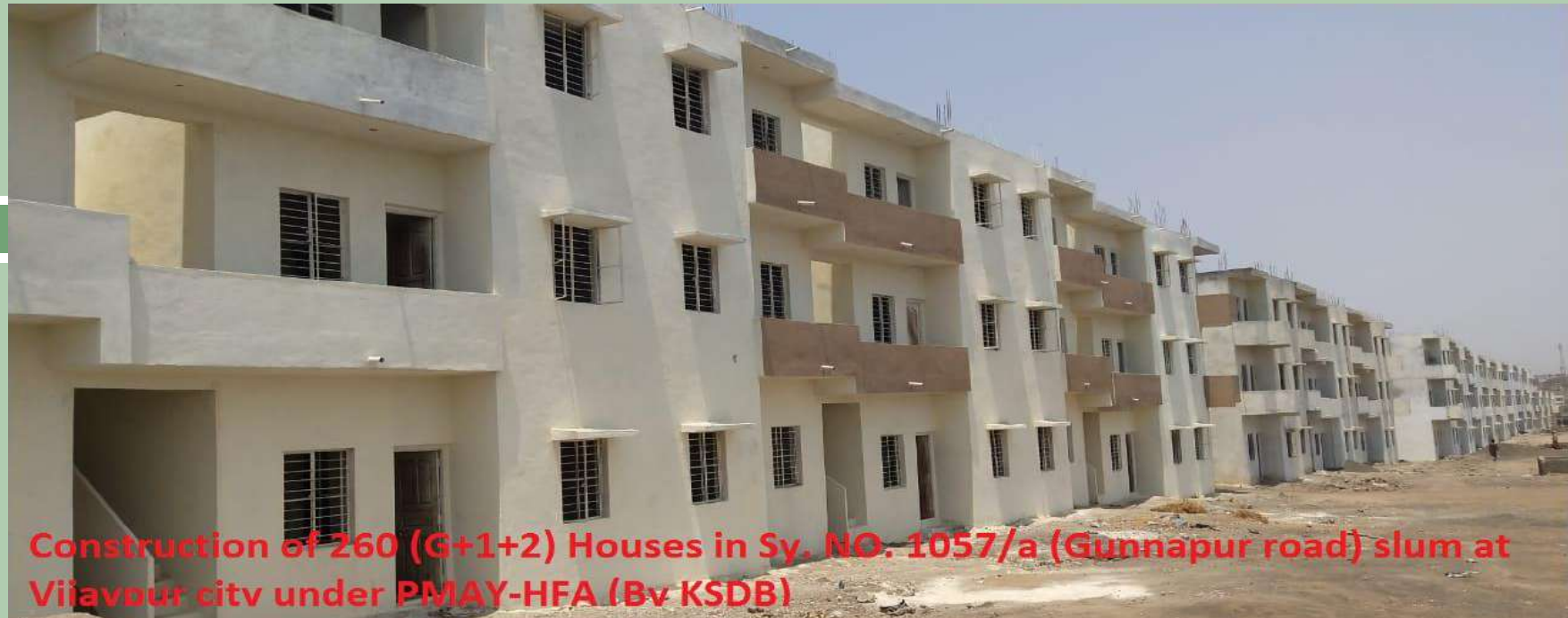
Construction of 260 (G+1+2) Houses in Sy. NO. 1057/a (Gunnapur road) slum at Vijayapur city under PMAY-HFA (By KSDB)