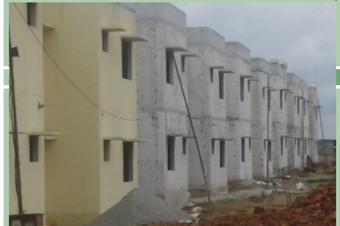
Construction of 3630 Houses under PMAY (U) in Gadag-Betagreri, Gadag District