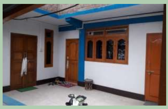
8. Beneficiary: Yang Dron Location: Near Power House

6. Beneficiary: Lama Leki Location: Near Power House