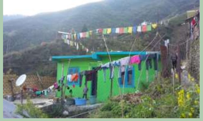
4. Beneficiary: Rita Moriju Location: Medical Colony

2. Beneficiary: Bichey Rikong Location :Apeda Colony