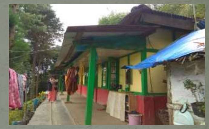
8. Beneficiary: Lobsang Droima Location: Forest Colony