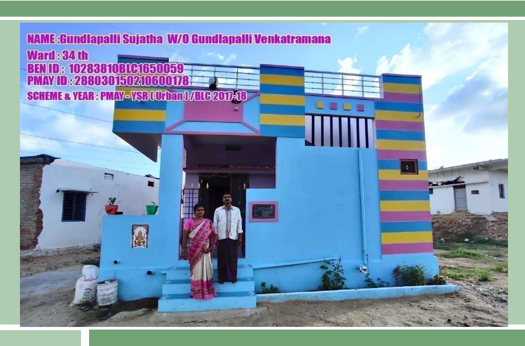
BLC - House in Chittoor Municipal Corporation