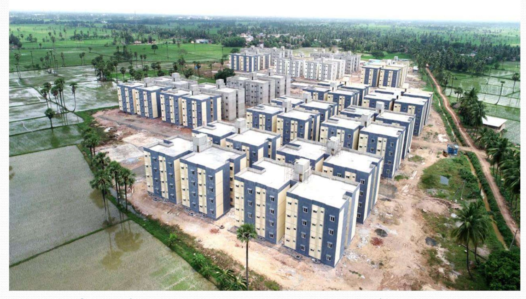
Ramachandrapuram ULB, East Godavari District