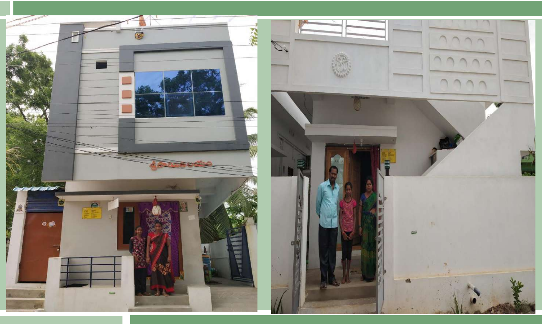
BLC - House in Ramachandrapuram Municipality