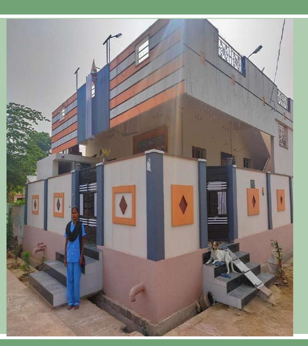
BLC - House in Eluru Municipality