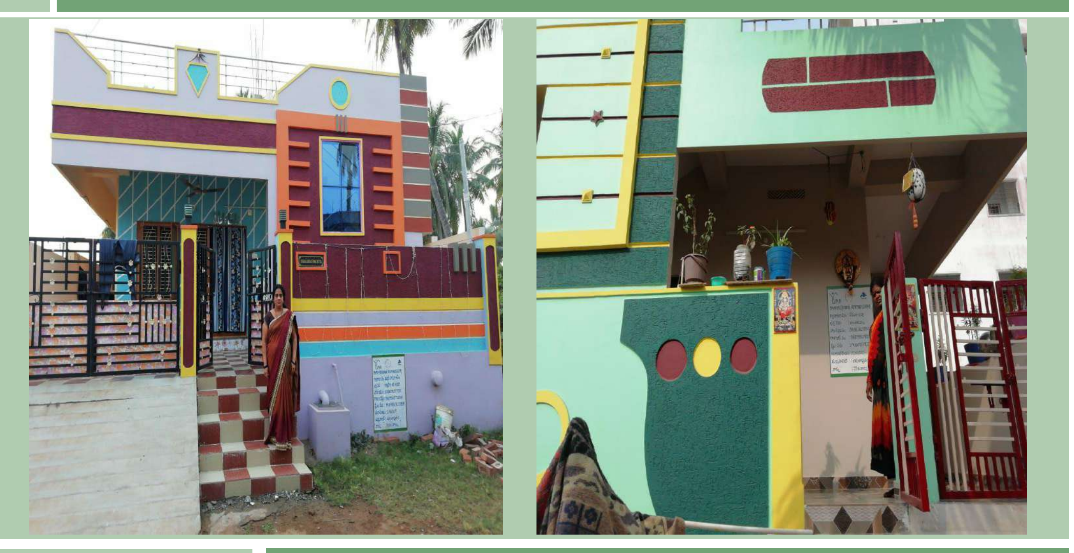
BLC - House in Amalapuram Municipality