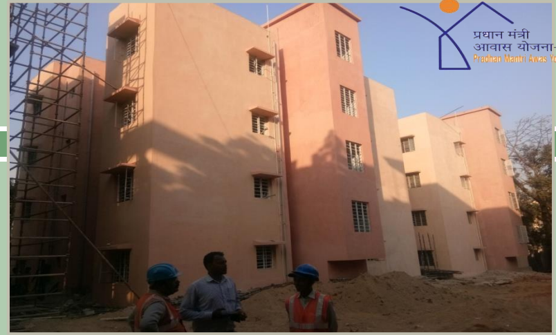
Navjivan Kust Ashram,