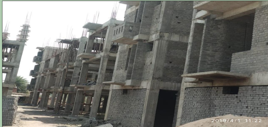
Islam Nagar, Ranchi