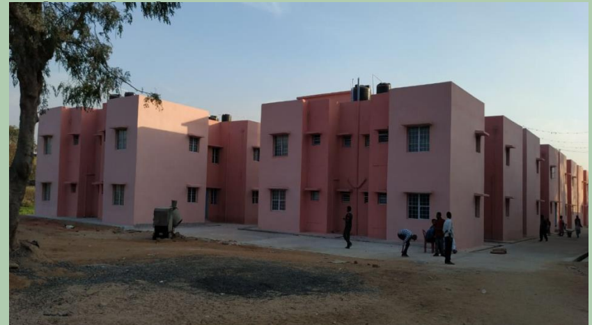
Kalirekha Kust Ashram, Deoghar