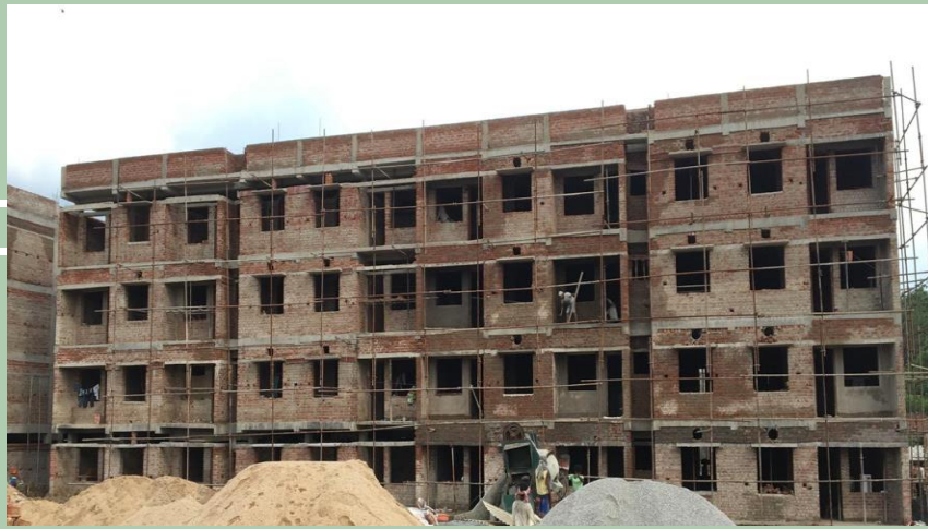
Birsa Smriti Park, Ranchi