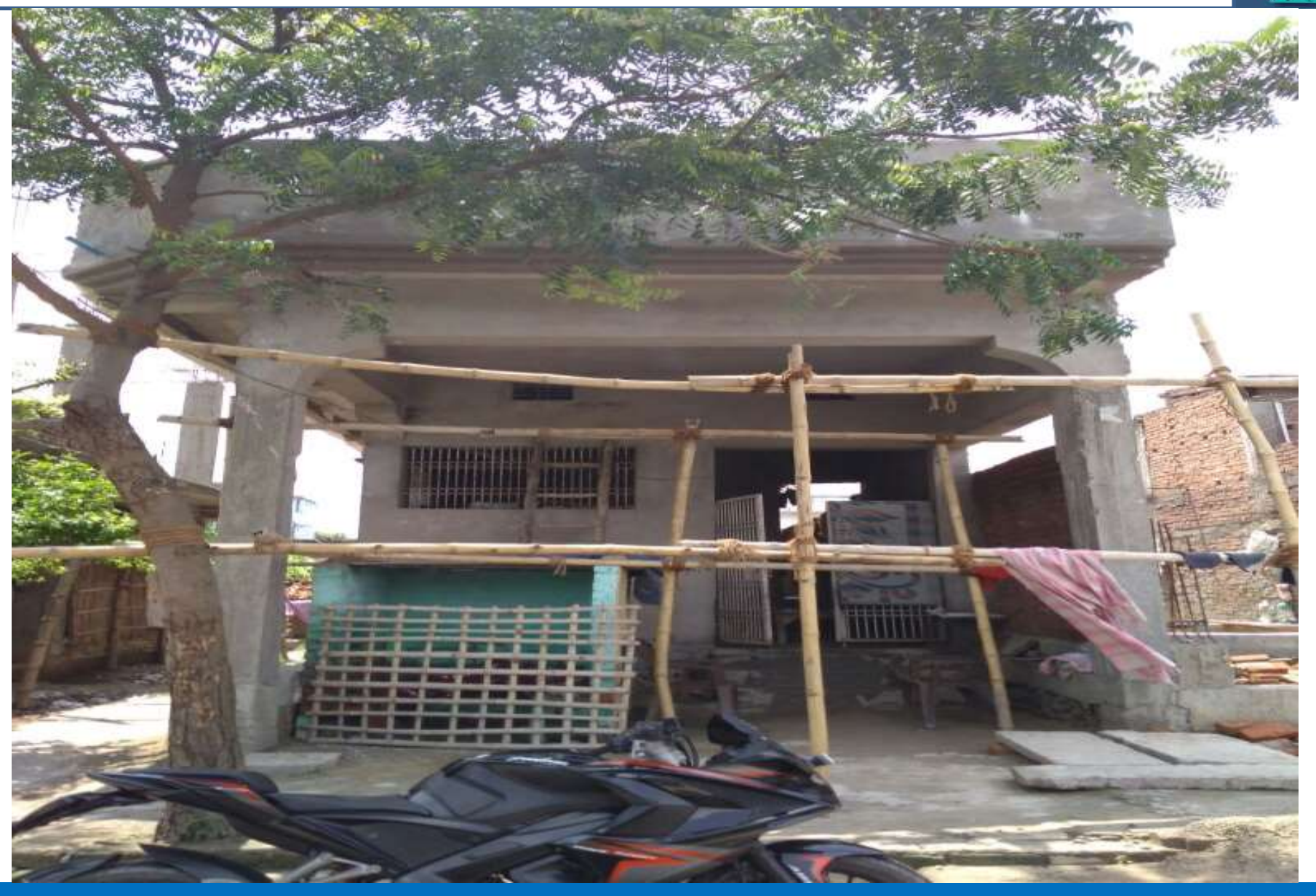
Urban Development and Housing Department, Govt. of Bihar