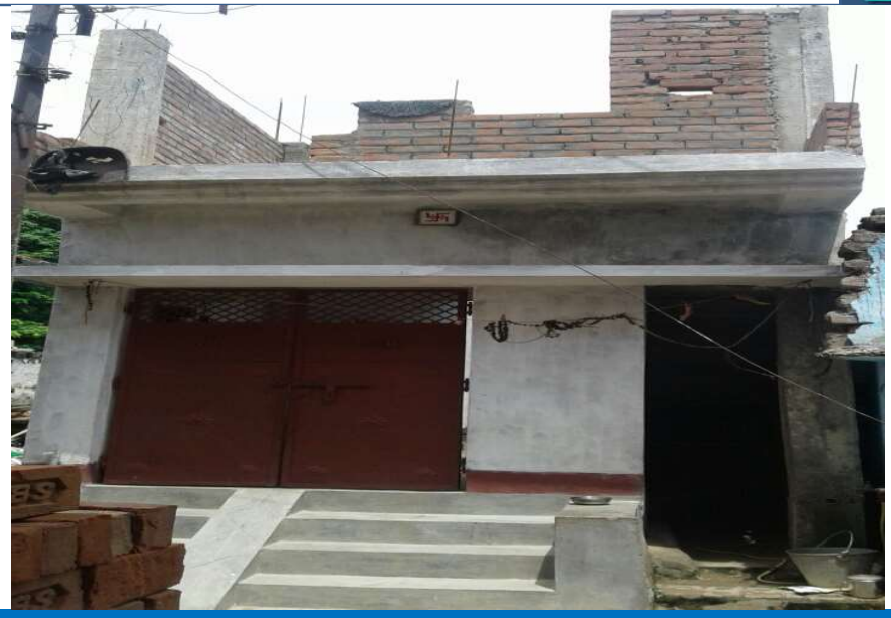
Urban Development and Housing Department, Govt. of Bihar