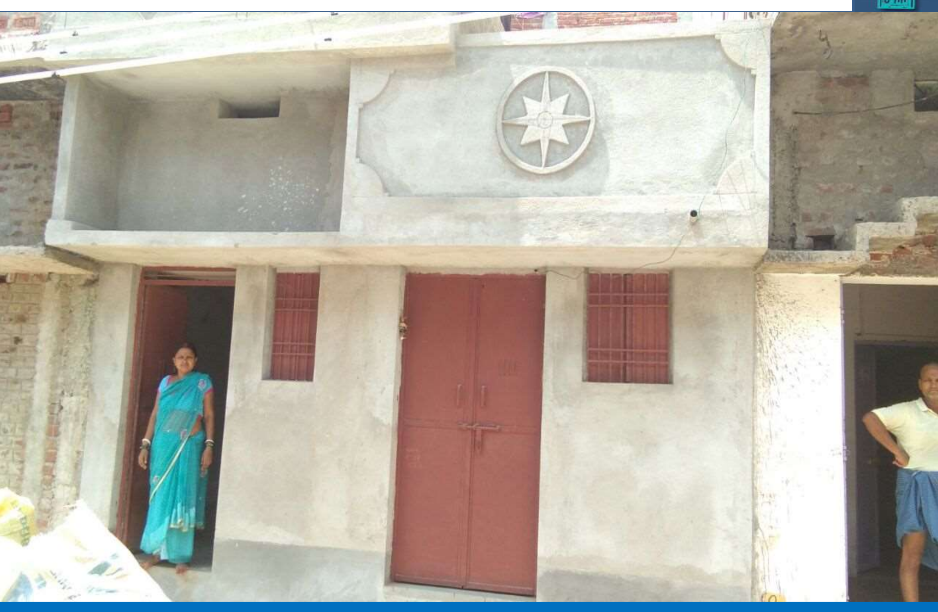
Urban Development and Housing Department, Govt. of Bihar