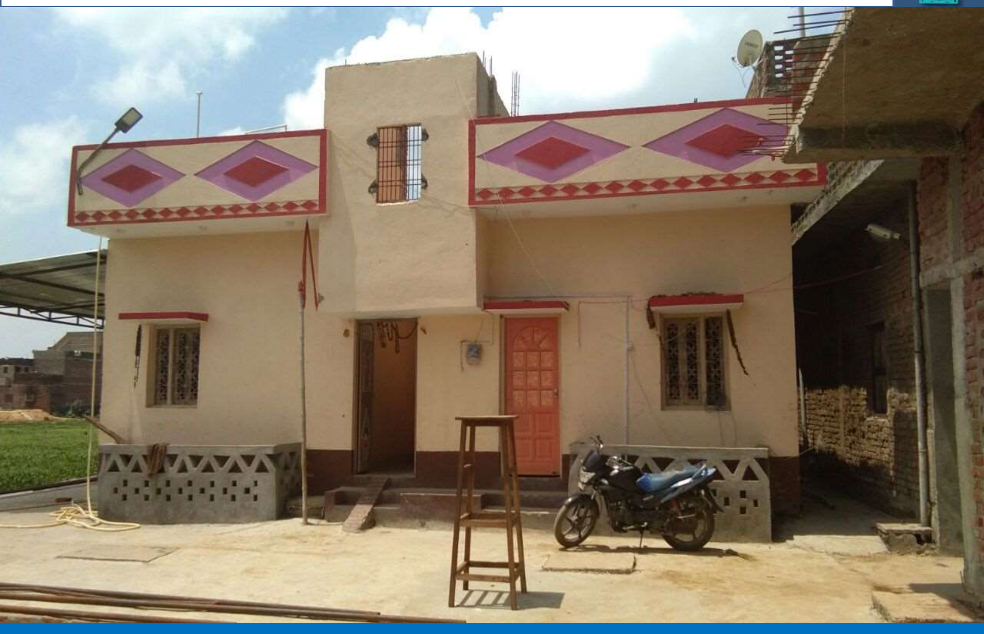
Urban Development and Housing Department, Govt. of Bihar