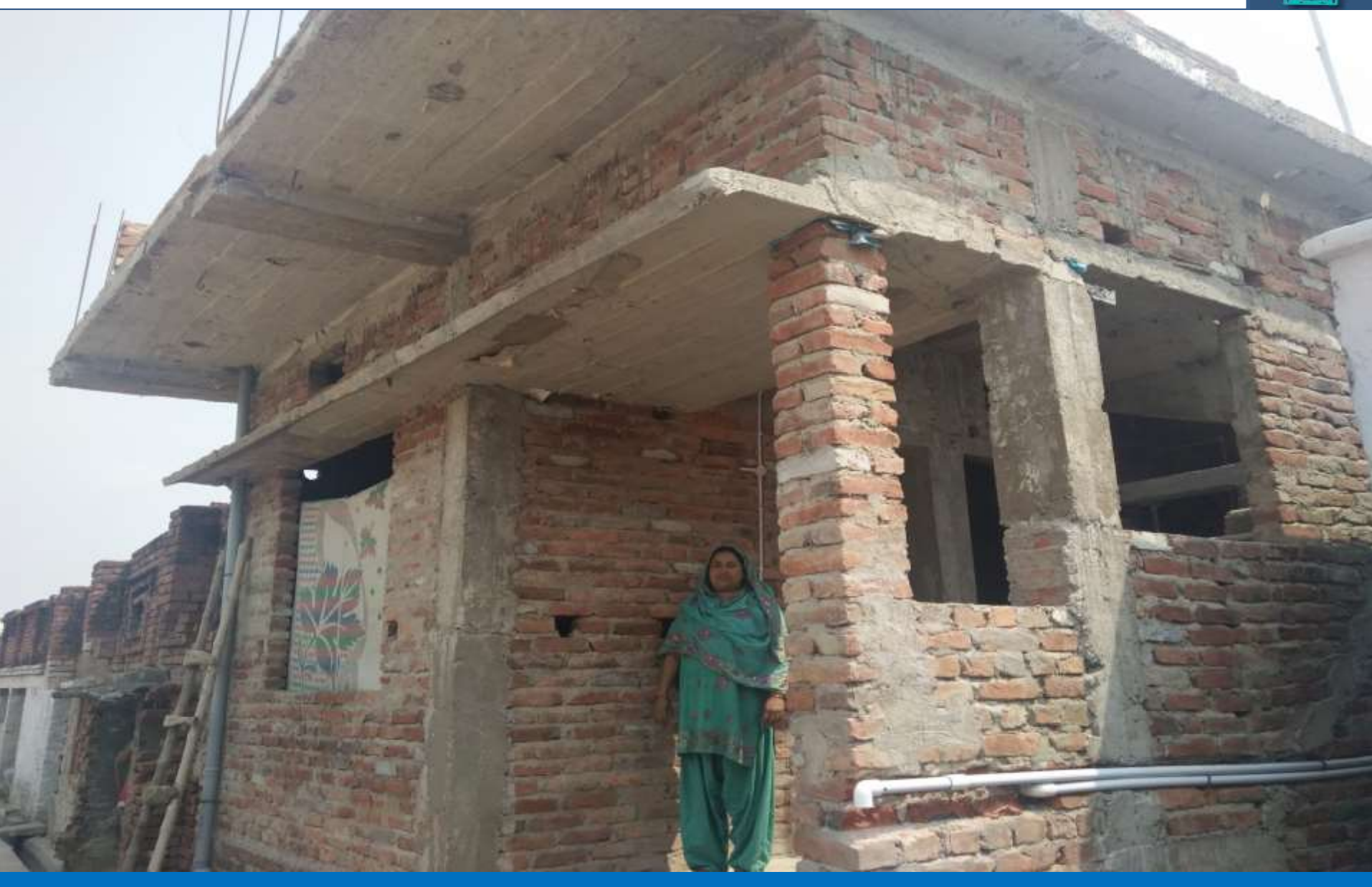
Urban Development and Housing Department, Govt. of Bihar