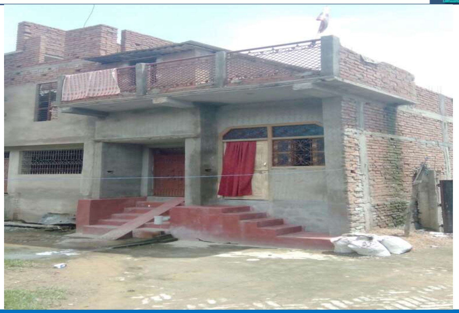
Urban Development and Housing Department, Govt. of Bihar