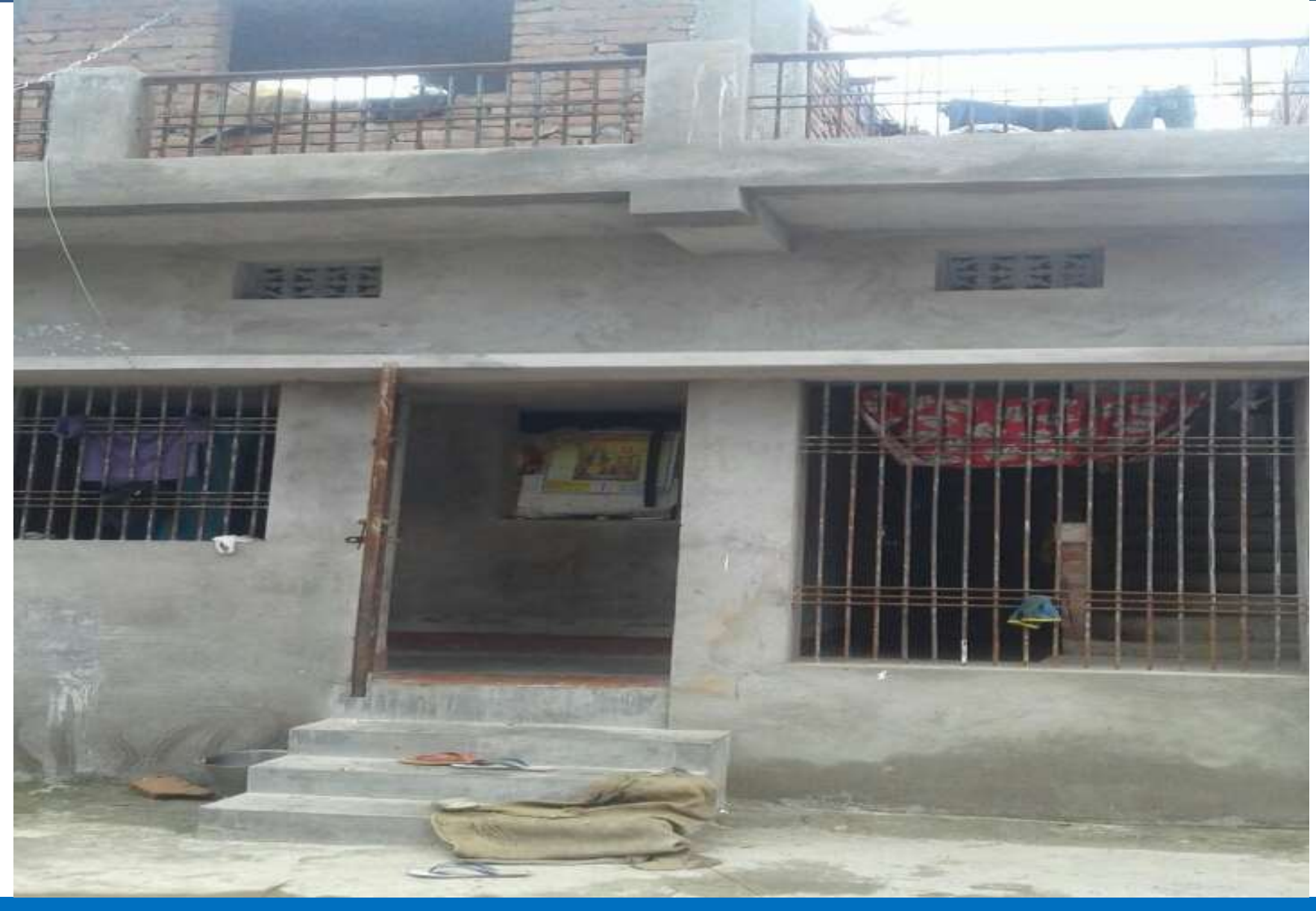
Urban Development and Housing Department, Govt. of Bihar