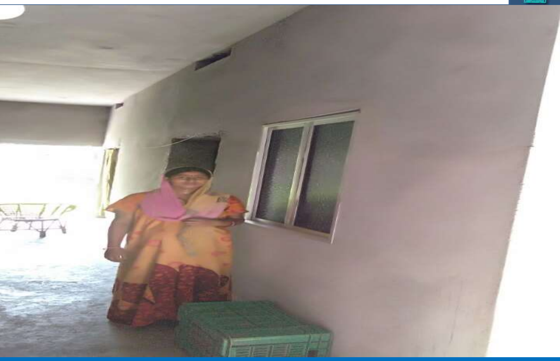
Urban Development and Housing Department, Govt. of Bihar