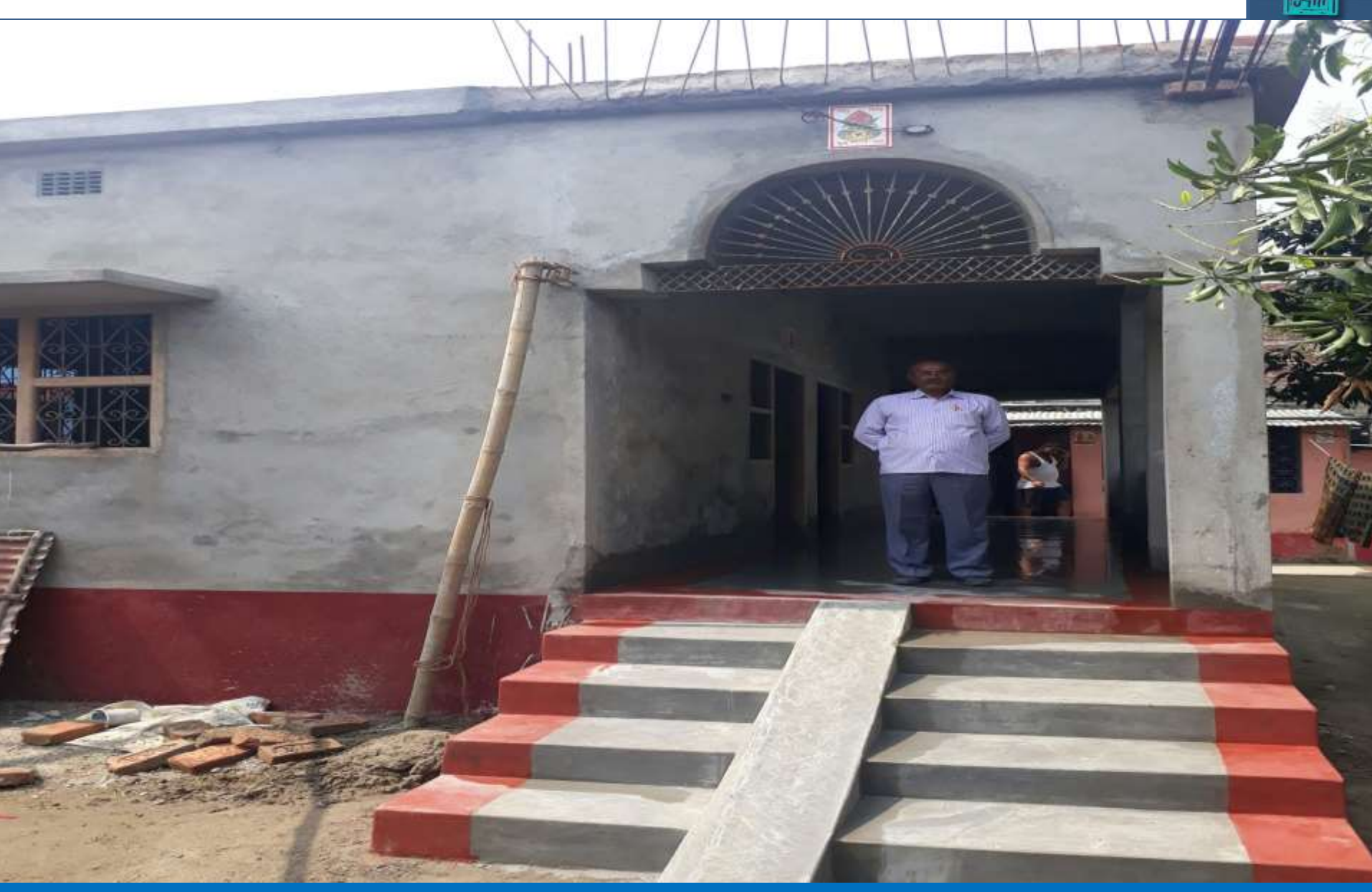
Urban Development and Housing Department, Govt. of Bihar