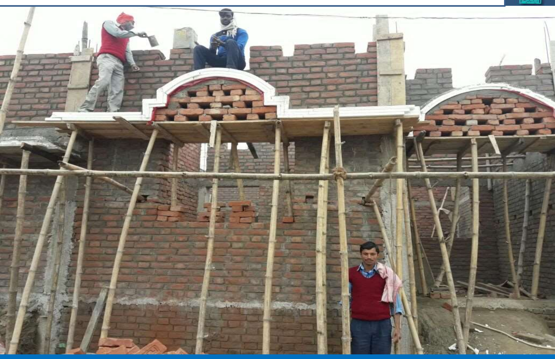
Urban Development and Housing Department, Govt. of Bihar