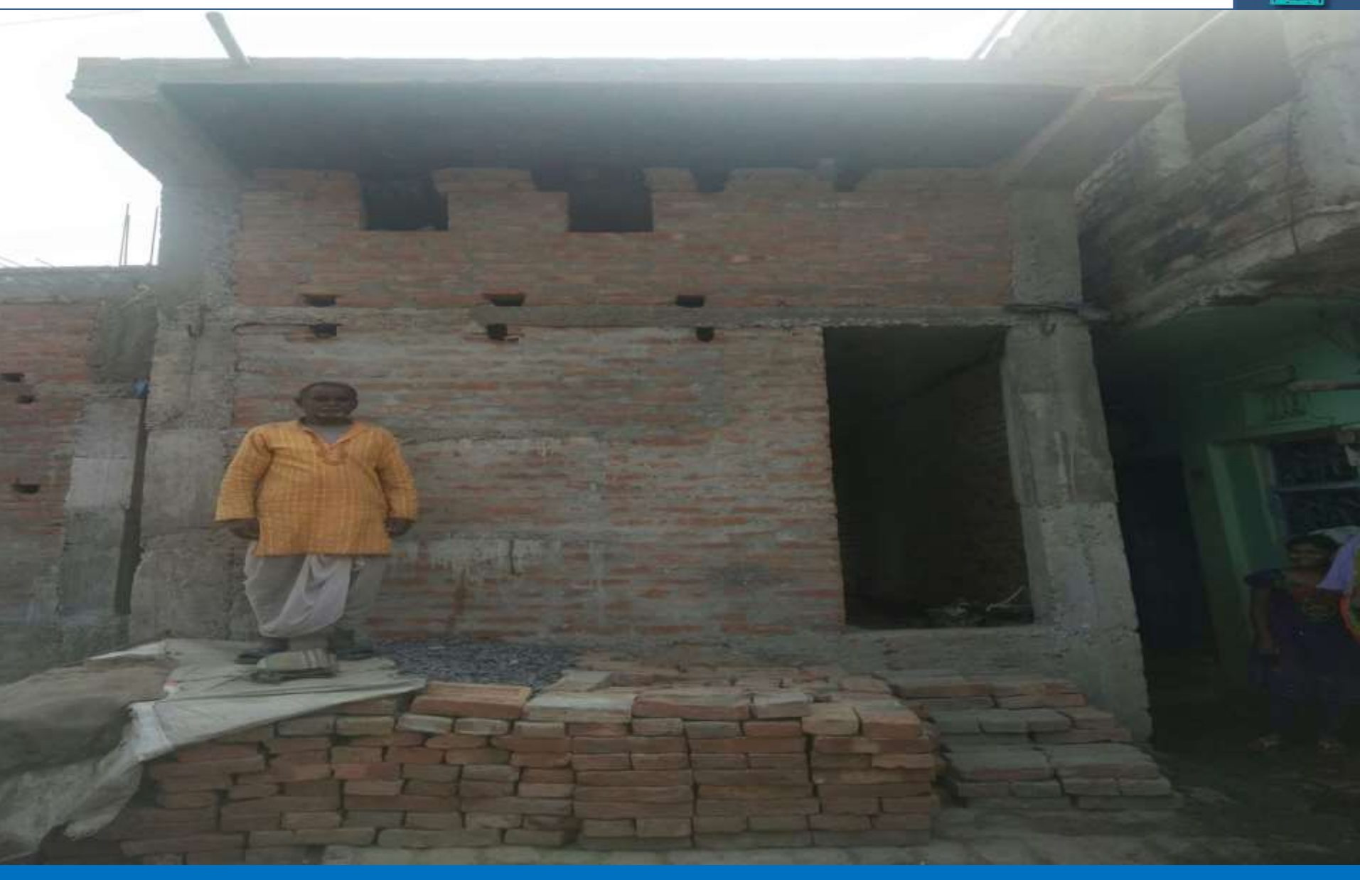
Urban Development and Housing Department, Govt. of Bihar