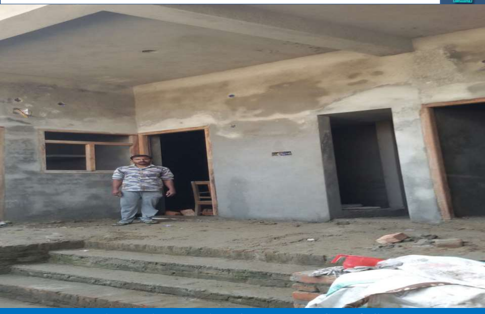
Urban Development and Housing Department, Govt. of Bihar