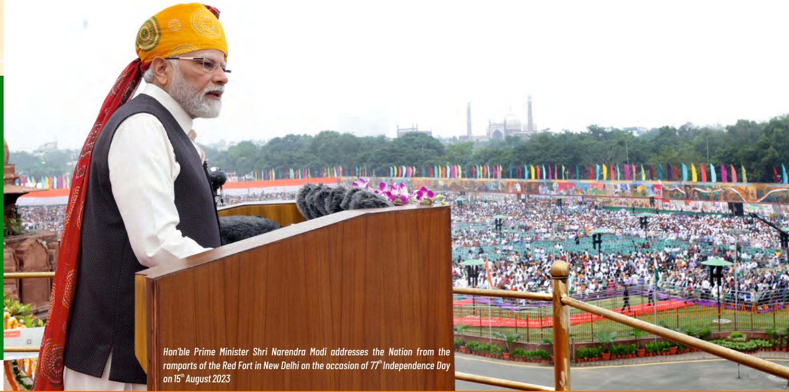
Hon'ble Prime Minister Shri Narendra Modi addresses the Nation from the ramparts of the Red Fort in New Delhi on the occasion of 77th Independence Day on 15th August 2023