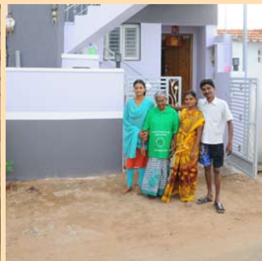
BLC completed house with satisfied beneficiary family in Coimbatore, Tamil Nadu