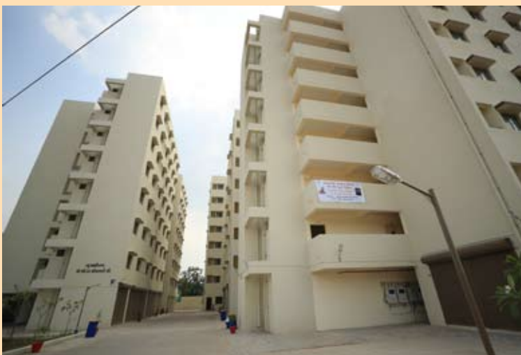
Completed project in Ahmedabad, Gujarat under In-Situ Slum Redevelopment (ISSR)

If required, these models may be tweaked to suit the State Governments requirements to promote public private partnership (PPP) in a big way to fulfill the Mission objective. In these models, public land has been used as a resource to cut down the cost or cross-subsidise the cost of EWS/LIG houses or allowing deferred payment (as annuity or hybrid) to bring down upfront burden to the State exchequer.