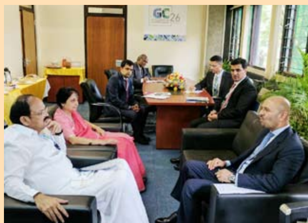
Glimpses of Meetings on the sidelines of 26th Governing Council of UN-Habitat

inclusive, sustainable and adequate housing for a better future; (ii) Synergies and financing for sustainable urbanization, and (iii) Integrated human settlements planning for sustainable urbanization.