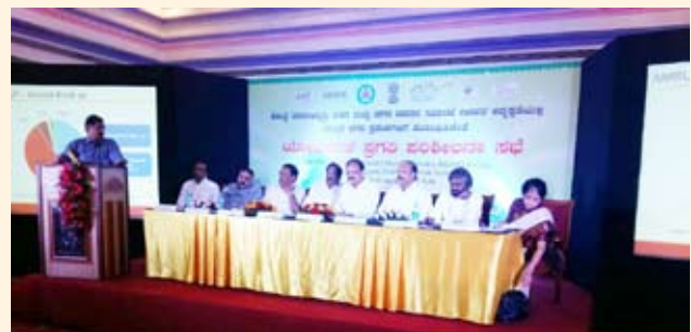
Karnataka review held in Bangaluru on 02 May 2017