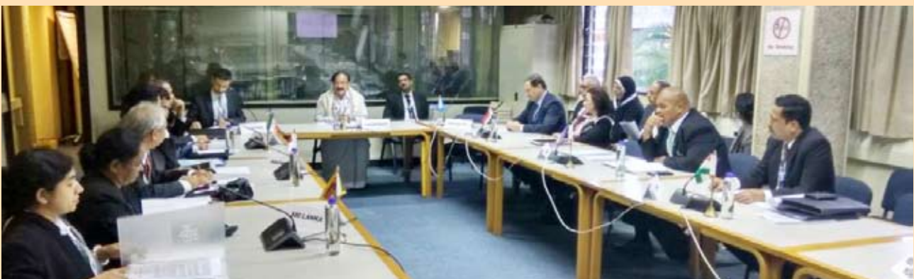
Glimpses of 26th Governing Council of UN-Habitat and Bureau Meeting of APMCHUD