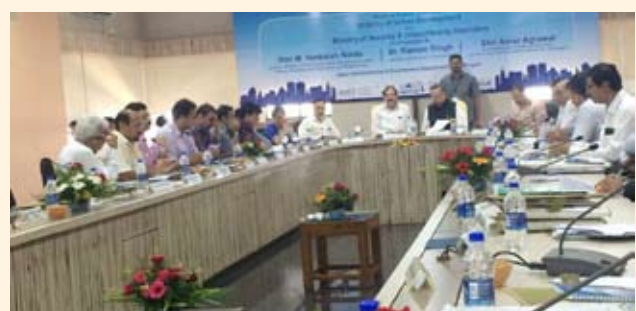
Chattisgarh review held in Raipur on 26 May 2017