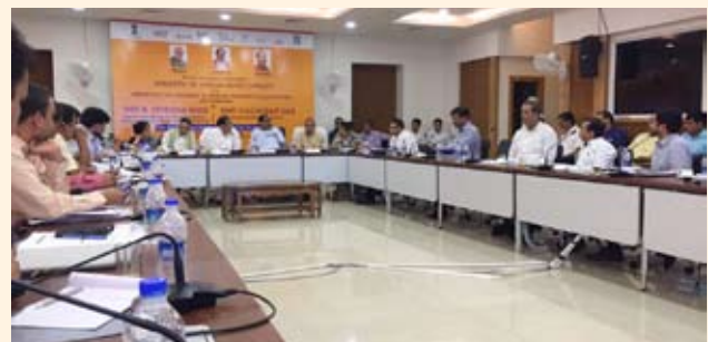
Jharkhand review held in Ranchi on 19 May 2017