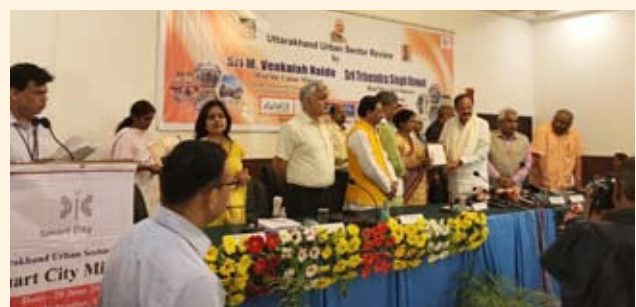
Uttarakhand Review held in Dehradun, Uttarakhand on 29 June 2017