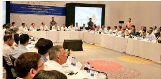
NE States review held in Guwahati on 18 April 2017

States remaining to be reviewed are: Andhra Pradesh, Himachal Pradesh, Jammu and Kashmir, Odisha, Punjab, Telangana and West Bengal and UTs to be reviewed are – Delhi, Puducherry, Andaman & Nicobar Islands, Chandigarh, Dadra and Nager Haveli and Daman & Diu.