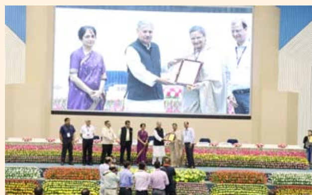
Glimpses of Two Years of PMAY(U) Celebration