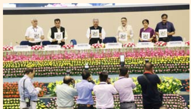
Glimpses of Two Years of PMAY(U) Celebration