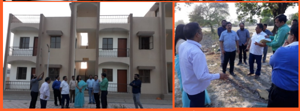
Project Review and LHP Site Visit at Lucknow, Uttar Pradesh

Director (HFA), MoHUA, reviewed the PMAY(U) project progress with officials of SUDA, Awas Bandhu, DUDA, and Lucknow Municipal Corporation. MoHUA officials and PMAY(U) PMU Expert along with the officials from Government of Uttar Pradesh, visited the AHP and BLC Projects. They also visited the proposed site of Light House Project (LHP) at Lucknow, UP. This is one of the six shortlisted LHP Sites under Global Housing Technology Challenge-India (GHTC-I).