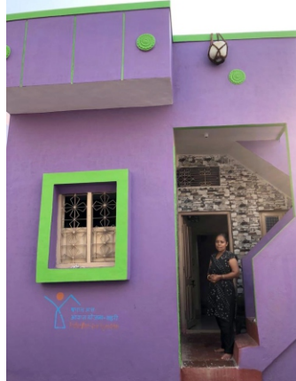
PMAY(U) BLC House, Karnataka