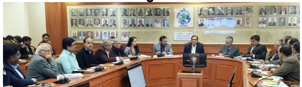
2nd Town hall Meeting for GHTC-India chaired by JS&MD (HFA)

The 2nd Town Hall meeting was conducted by MoHUA on February 15, 2019 to give all necessary information and clarifications related to submission of a bid or proposal for Global Housing Technology