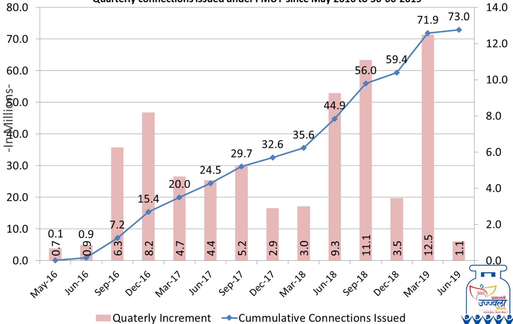
Quarterly connections issued under PMUY since May 2016 to 30-06-2019